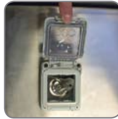
The key switch is placed in a watertight box.

All electronic parts and the motor have watertight casings.