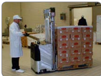
Optimum safety through transparent and impact-resistant safety screen and reduced driving speed in raised position.