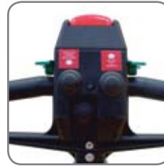
Central location of all control buttons.