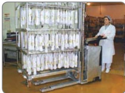
Logi-Inox SELF PLUS in the food industry.