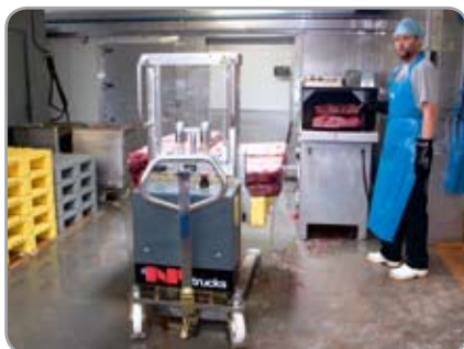
RF-SEMI - for the food industry and other environments with strict hygiene demands.