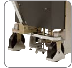
EHS 1000 RF-SEMI has assisted wheel steering. Easy and hygienic operations.

Available with manual or electric lifting.