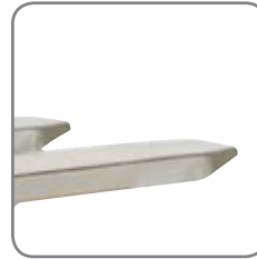
Closed forks mean easy cleaning and few hiding places for bacteria.