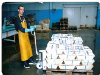
RF-SEMI - for the food industry in areas, where hygiene demands are not so high, but corrosion resistance important.