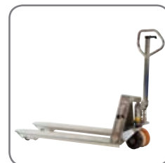
The pallet truck is also available in an explosion proof version.