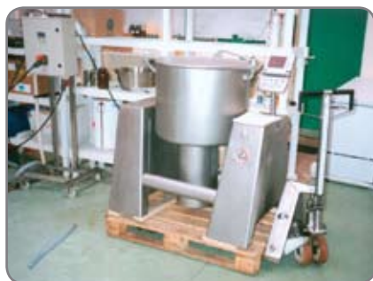
RF-PLUS - for the food industry and the pharmaceutical industry with strict hygiene and sanitation requirements.