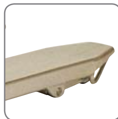
Closed forks mean easy cleaning and few hiding places for bacteria.