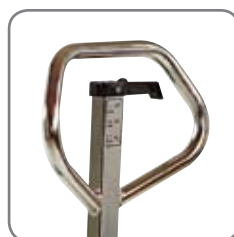
Ergonomic handle ensures the user a relaxed hold.