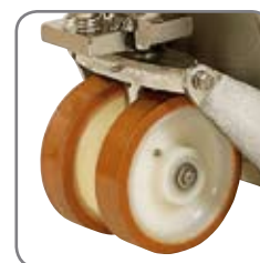
Wheels with rubber-sealed bearings.

Please ask for specification details or visit our website www.logitrans.com We also offer tailor-made solutions.