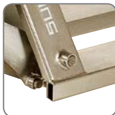
Completely open or completely closed truck elements facilitate efficient cleaning.