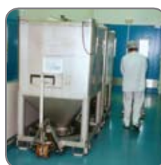
RF-PLUS pallet truck being used in the pharmaceutical industry.