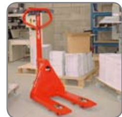
Panther is available with different fork lengths.