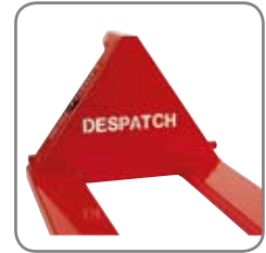
The company name or logo can be cut out in the triangle of the Panther.