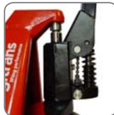
Permanent quick lift.