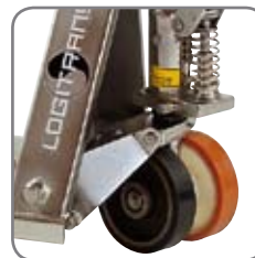
Different wheel types, to suit the needs of the user.