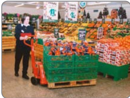
Adjustable fork height - no problems when handling low and worn pallets.

Stainless and explosion proof pallet trucks are also available.