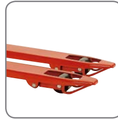
The hoop skates on the forks ensure an easy fork insertion and withdrawal in/out of pallets.