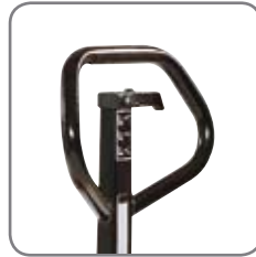
Ergonomic handle ensures the user a relaxed hold. Can be marked with name/department.