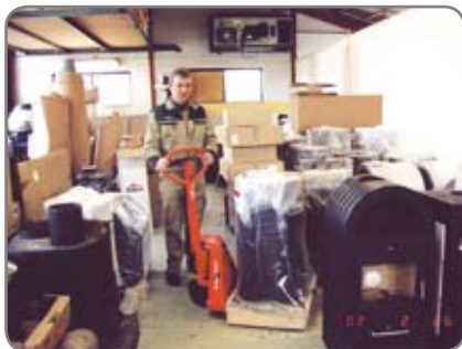
An easy handling of goods is ensured even in very confined spaces.