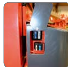
Easy access to all components makes service of the truck straightforward.