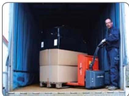
Panther Maxi (capacity 1800 kg) is recommended for heavy pallet transport, e.g. in the transport industry.