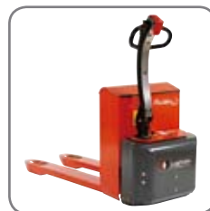
Strong construction ensures a long operating life and low maintenance costs.