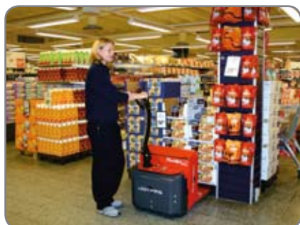
Panther Mini (capacity 1400 kg) is recommended for easy pallet transport, e.g. in super markets and in stock areas.