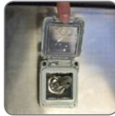
The key switch is placed in a watertight box.