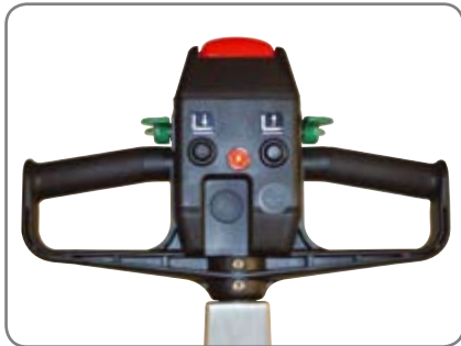
Central location of all control buttons.

All electronic parts and the motor have watertight casings.