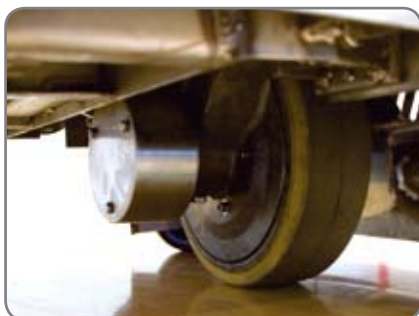
The stainless propulsion motor manages aggressive and wet environments down to -30°.