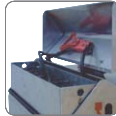
The batteries are placed in a holder - easy and quickly to exchange.