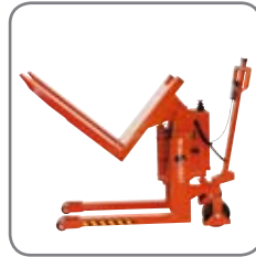
Perfect working position when emptying boxes and crates - sitting as well as standing.

Strong construction ensures a long operating life and low maintenance costs.