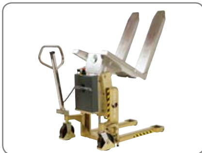
The Logitilt is also available in stainless steel.