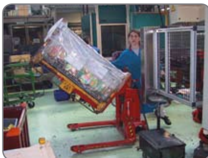
The straddle model makes it possible to handle closed pallets. The Logitilt being used in the component industry.