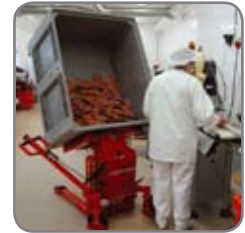
The Logitilt being used in the food industry.