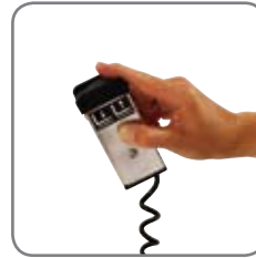
Remote control for the tilt function.