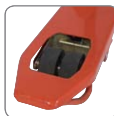
With twin fork wheels it is very easy to change direction.