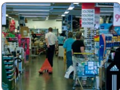
Panther Silent in a supermarket, where comfort and well-being of the customer are vital.