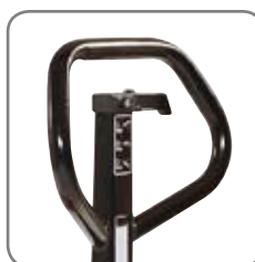
Ergonomic handle ensures the user a relaxed hold.