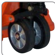
The special rubber wheels are gentle to floor and flagstone layer and do also have eminent anti-static qualities.