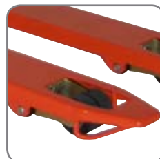
The hoop skates on the forks ensure an easy fork insertion and withdrawal in/out of pallets.