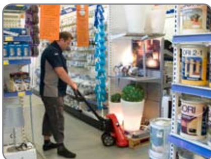
Easy handling of goods is ensured even in very confined spaces.