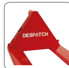
The company name or logo can be cut out in the A-frame of the Panther Silent.