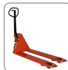
Panther Silent has permanent quick lift.