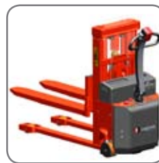
Hour counter, battery indicator and error finding in the same instrument.