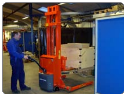
For intensive use, we recommend SELF or SELFS.

** Width between straddle legs of more than 1306 mm: Max. capacity 800 kg. Fork length of 1520 mm is not recommended.