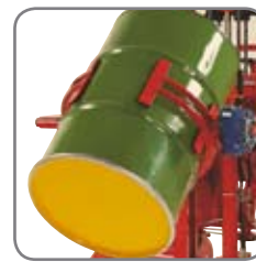
Available with optional extras, e.g. crane arm, drum turner, boom, remote control and level control.