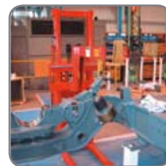
Available with side-tilting forks and/or optional extras, e.g. crane arm, drum turner, remote control, level control, built-in charger.