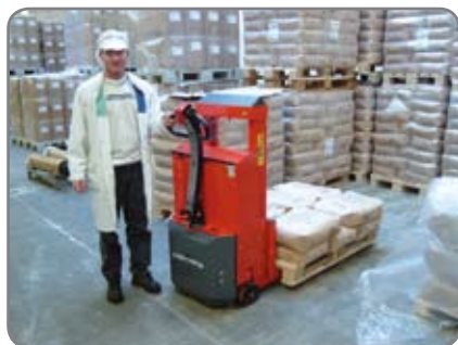
Optimum safety through transparent and impact-resistant safety screen and reduced driving speed in raised position.