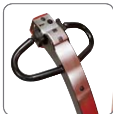
Possible to operate with the handle upright. Central location of all control buttons.

Strong construction ensures a long operating life and low maintenance costs.