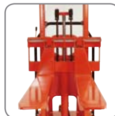
Adjustable forks are available as optional extra in many different lengths and types.