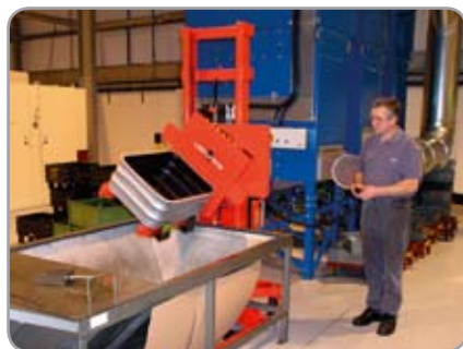
Available with side-tilting forks and/or optional extras, e.g. drum turner, crane arm, spear, remote control, level control.

***** Tests show that 1700 mm are enough.