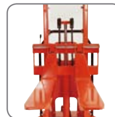
Adjustable forks are available as optional extra in many different lengths and types.

Available with manual and electric lifting.