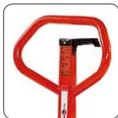
Ergonomic handle ensures the user a relaxed hold. The handle can be marked with the name/department.

Strong construction ensures a long operating life and low maintenance costs.