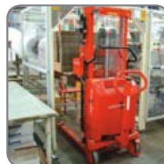
High manoeuvrability: Short overall length, large turning angle, assisted steering and low own weight.