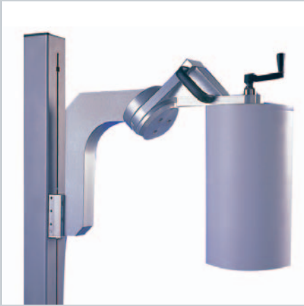
■ MANUAL REEL MANIPULATOR