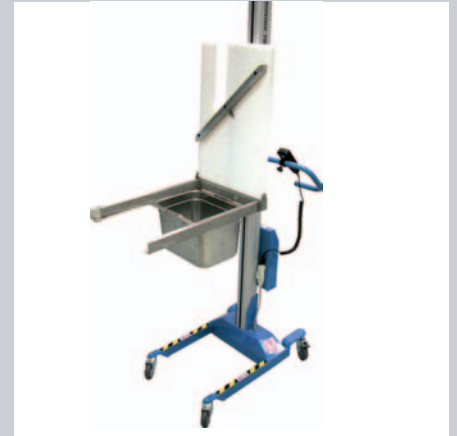
■ E90 KG FOLDING PLATFORM