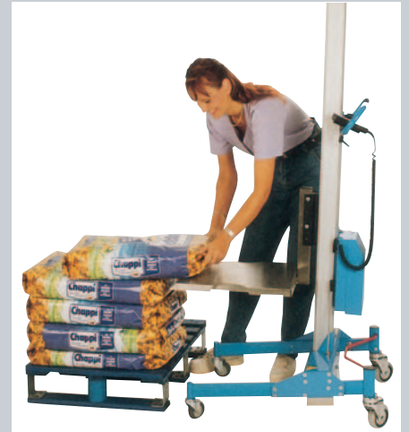
■ 70 KG SACK HANDLING