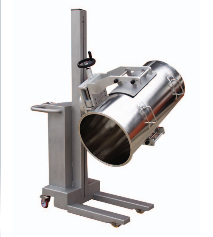
■ STAINLESS STEEL DRUM ROTATOR