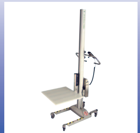
■ 70 KG STAINLESS & ALUMINIUM