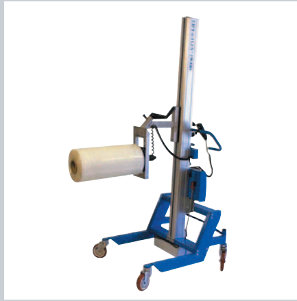
■ ELECTRIC REEL MANIPULATOR