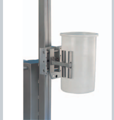
■ KEG ROTATOR