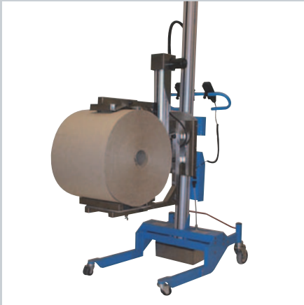
■ 110 KG REEL ROTATOR