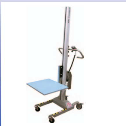
■ 90 KG ESD COMPLIANT