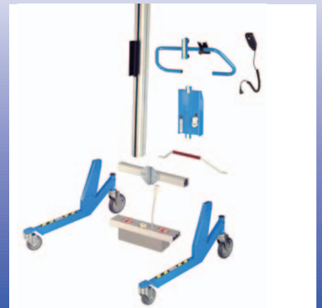
■ MODULAR SYSTEM