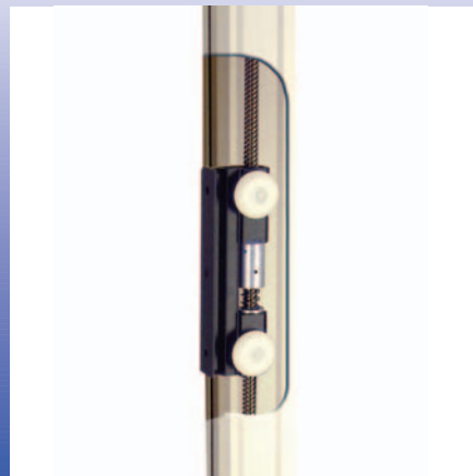
■ SPINDLE DRIVE