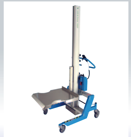
■ 160 KG STAINLESS PLATFORM