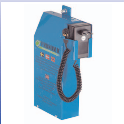
■ MAINTENANCE FREE BATTERY