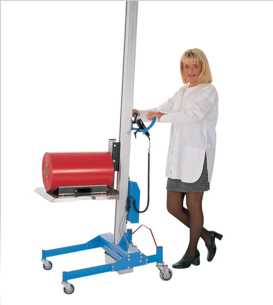
■ 110 KG REEL V BLOCK