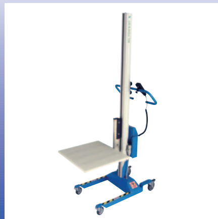
■ 70 KG STANDARD PLATFORM