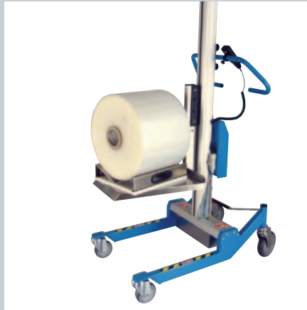
■ 125 KG REEL V BLOCK