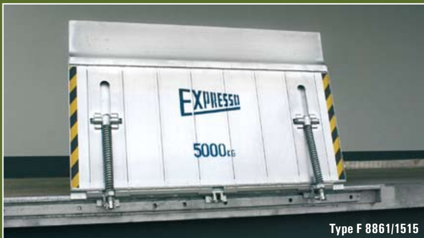
Type F 8861/1515

Mounted in fixed guide rails (see page 2), these spring-loaded dock levellers are suitable for loads up to 5000 kg, and are fitted with ball bearings so that one person can slide them sideways to the required position without effort. Mounting a guide rail along the full length of the loading ramp permits trucks and vans to be unloaded/loaded anywhere, without them having to back up to an exact position. The levellers are lowered and raised to the parked position by means of a chain with handle. A spring mechanism secures the leveller in the upright position. The mechanism is released manually. For safety reasons, it is not possible to move the levellers in the lowered (working) position. Angled roll-on/roll-off plates ensure smooth traversing. A professional levelling solution that offers utmost flexibility.