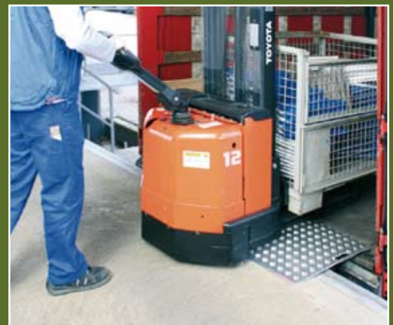
Type F 8773/15R