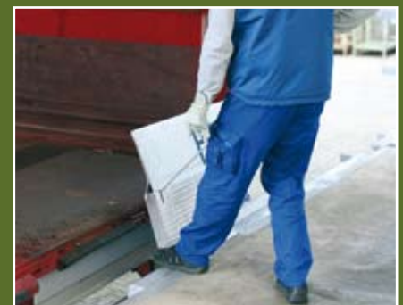
... release the catch with the foot pedal...