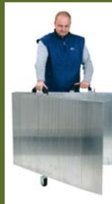
Roll to the site, unfold, put in position, and load/unload.