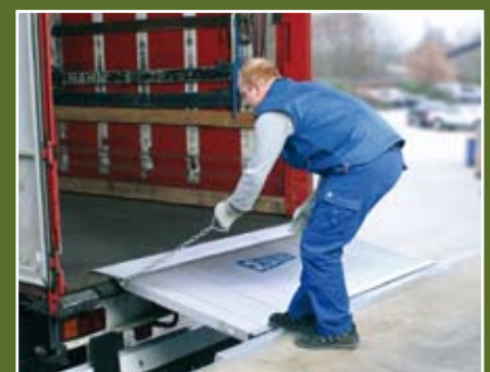
... the leveller is lowered...