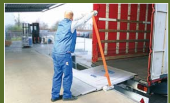
... remove the operating handle...