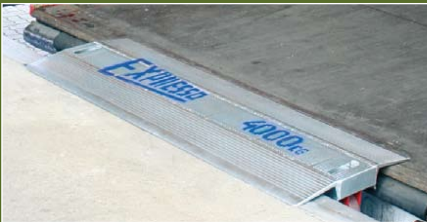
Type F 7205 1

These dock boards are used wherever goods need to be loaded/unloaded from different vehicle types (different loading heights). Whether loading/unloading trucks, vans or rail wagons (also from the side). These perfectly adaptable dock boards are able to bridge height differences up to 90 mm. Moreover, due to the angled roll-on & roll-off plates, these versions can be traversed with large transport devices, thus ensuring short turnaround times. For convenient handling at the loading site, the dock boards are fitted with a wheel and handhold cutout. Stop flanges provide assistance when positioning the dock board. Optional, retractable pockets for forklift prongs permit fast transport to the loading site, and as an alternative to the standard handhold cutouts, we also offer welded-on aluminium grips.