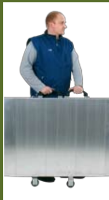
Type 8 772 26