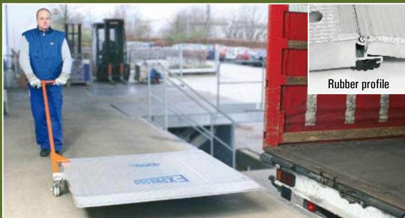
Type F 1520

By means of the wheeled and lacquered steel (optionally galvanized) operating handle or lever frame, which is included in delivery, these large dock boards for flexible application are handled easily and can be positioned precisely by a single person. This dock board is the ideal solution in cases where there is no permanently installed loading/unloading aid, and flexibility must be ensured. Ergonomic handling is further enhanced by the unique, dual-hinged roll-on plate, which ensures smooth loading/unloading operations, because it adapts perfectly to the ramp and compensates unevennesses. In addition, the dock board is fitted with a rubber profile underneath, which prevents slipping and reduces noise. Optional, recessed forklift prong pockets for Types F 1515 to F 2020 permit fast transport to the loading/unloading site.