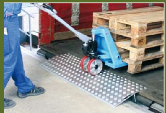
Type F 8771/15