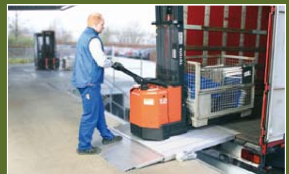
... load/unload. Done!