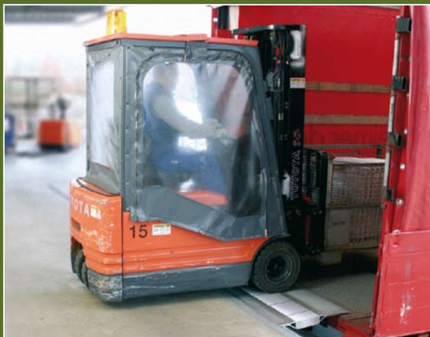
Type F 6515