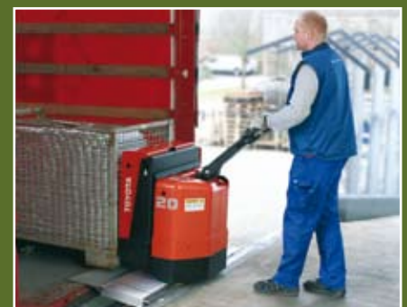
... load/unload. Done!

Dock boards should not be used at angles of more than ± 12,5% (approx. 7°).