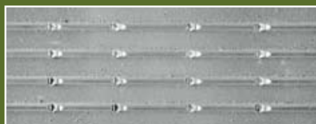
Cross-grooved 'plus' profile

Answering the following questions is important for selecting the perfect solution for your loading task: