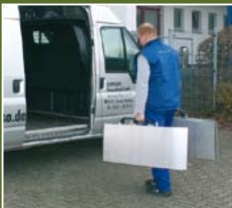
Type 8 772 44

These dock plates with cross-grooved treadplates can be stored conveniently and compactly in the van or truck, and are immediately available for loading/unloading. This lets the drivers work independently, enabling them to decide freely when and how to load/unload. This version is fitted with 2 x 2 hand-friendly plastic grips as standard, enabling the dock plate to be positioned easily and quickly.