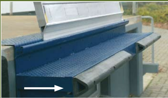
Type F 6016500 (650 mm), Type F 6017500 (750 mm), Type F 6019500 (950 mm) – per meter

It only takes a small but ingenious detail to provide an extra plus in efficiency and/or safety. In order to make loading/unloading operations even more efficient, but primarily safer, we offer a range of useful docking aids and accessories.