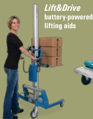
Lift&Drive battery-powered lifting aids