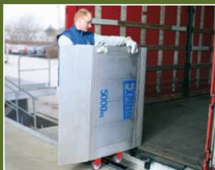
Roll to the site...

Additional convenience is provided by mobile dock boards with the unique, dual-hinged roll-on plate. Unevennesses e.g. on ramps are levelled out perfectly, greatly simplifying the use of loaded transport equipment with weights up to 5000 kg. Depending on version, height differences up to 240 mm can be traversed without problems. Another feature is the rubber profile at the supporting edge of the dock board, which prevents slipping and reduces noise. The board can be handled by a single person, and the handhold cutouts and two solid rubber wheels permit the board to be moved easily the loading/unloading location. Moreover, when not in use it can be stored upright to save space. Optional, retractable pockets for forklift prongs permit fast transport to the loading site, and as an alternative to the standard handhold cutouts, we also offer welded-on aluminium grips.