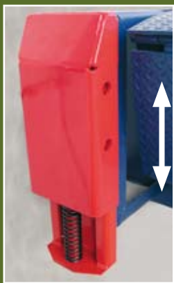
Type F 9019012 (per bumper), lacquered finish (mounted at ramp height)

They provide ideal assistance for truck drivers during backing-up to the ramp, and reduce the risk of damage. Moreover, this solution gives additional safety for trucks whose bumpers are higher than the ramp, as they ensure precise docking. Vertical ribs inside the bumpers act as shock absorbers, thus protecting the transport vehicles from damage. During loading/unloading, the spring-loaded docking aids move up/down. Optionally, galvanized versions are available instead of signal red.