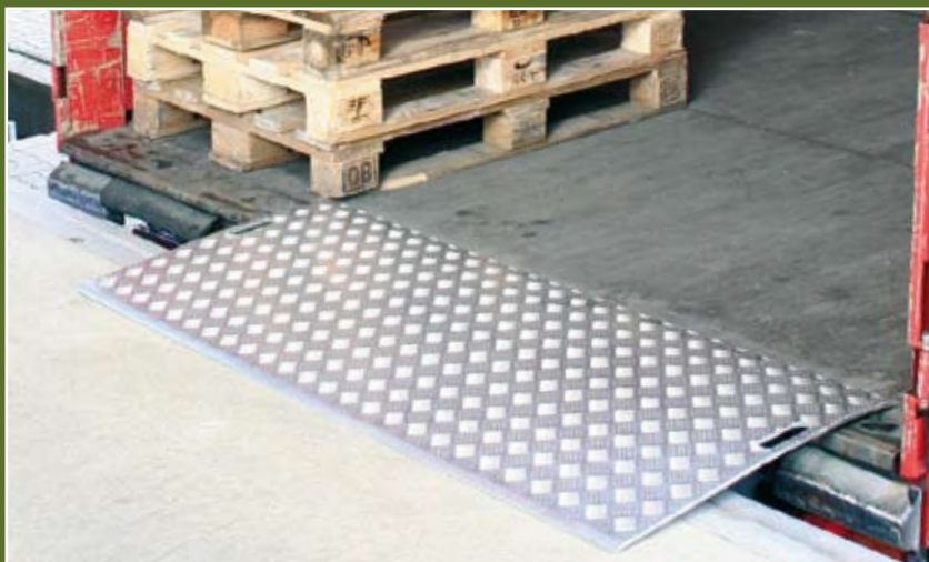
Type F 8773/15R

The outstanding features of these dock boards are low weight and high capacity loads, enabling them to be traversed safely with loads up to 4000 kg. They occupy minimum storage space in the goods inwards area, and can bridge height differences up to 100 mm. Depending on version, the dock boards are fitted with a central or full-width stop flange underneath. The flange ensured precise and safe docking.