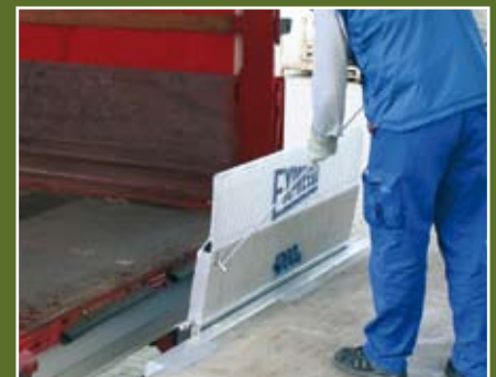
Insert the operating lever...