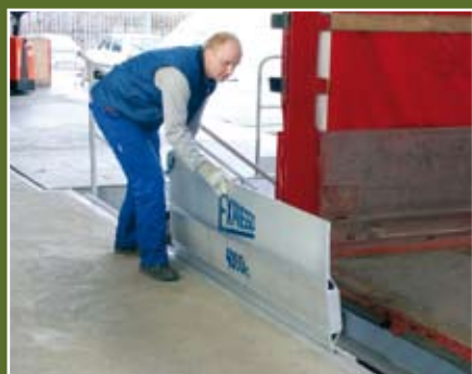
Slide to the required position...

With a load capacity up to 4000 kg, this simple sliding dock leveller is an alternative to the spring-loaded versions. It slides in a guide rail (see page 2) that is screwed or welded to the ramp. This saves time, because trucks simply back up to the ramp without exact positioning. In its vertical parking position, the leveller is secured automatically. It is released and lowered by means of an operating handle. In this way, a single person can handle loading/unloading operations.