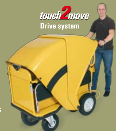
touch 2 move Drive system