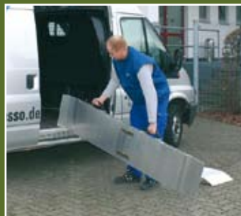
Put in position...