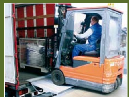
... load/unload. Done!

Dock boards should not be used at angles of more than ± 12,5% (approx. 7°).