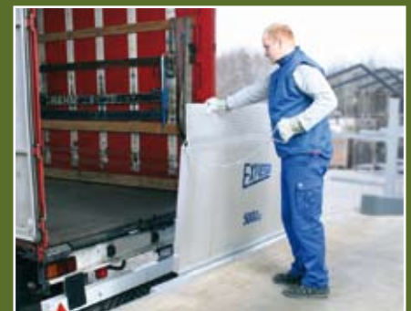
From the parked position...