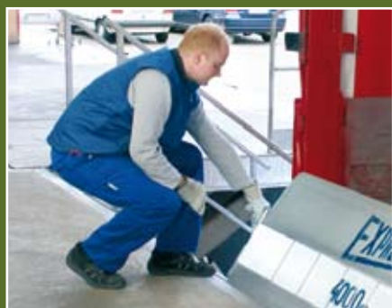
... lower. Done!