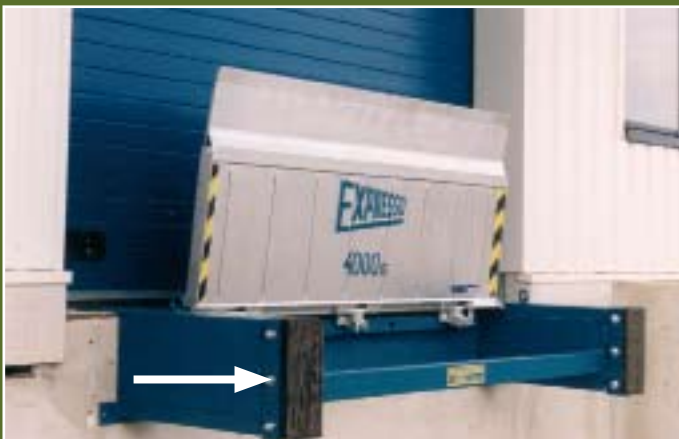
Type F 6036500 (650 mm), Type F 6037500 (750 mm), Type F 6039500 (950 mm) – Width 2,50 m

This docking aid consists of a full-length guide rail Type 6038860 (see page 2) for sliding dock levellers (see page 13), and an equally full-length buffer with wear-resistant rubber profile to provide backing-up protection along the entire width of the ramp. What's more, this docking aid is not only suitable for the construction of new ramps – it can be retrofitted easily for full-width protection of loading/unloading operations on the ramp. In addition, truck manoeuvring is speeded up for improved efficiency.