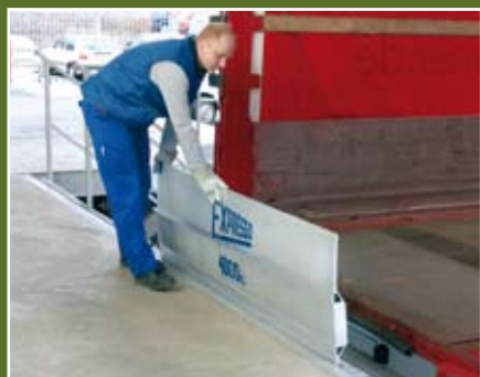
... by means of the guide-rail...