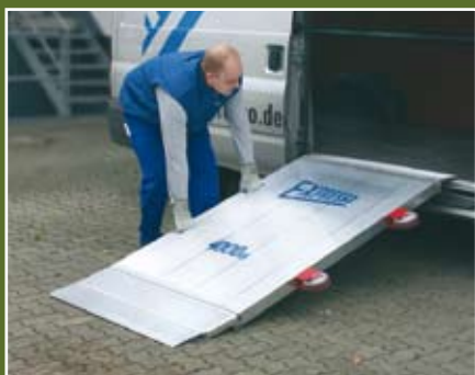
... put in position...