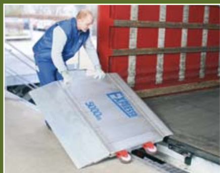
... position it ...