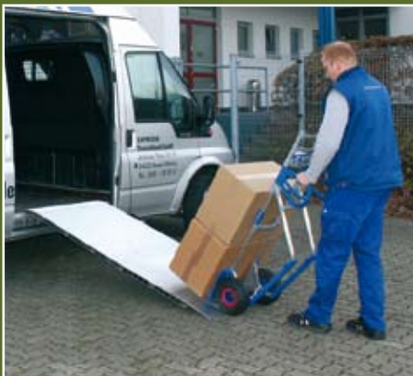
Type 8 772 20

Drivers who do not have a hydraulic tail-lift on their vehicle, do not have to struggle anymore, because EXPRESSO's mobile and/or folding dock plates with cross-grooved treadplates are ideal vehicle companions. Type 8 772 26 comes with two solid rubber wheels and two hand-friendly plastic grips as standard. Also for Type 8 772 20 we recommend the optional wheel set Type 1067 for ergonomic transport and handling of the loading aid.