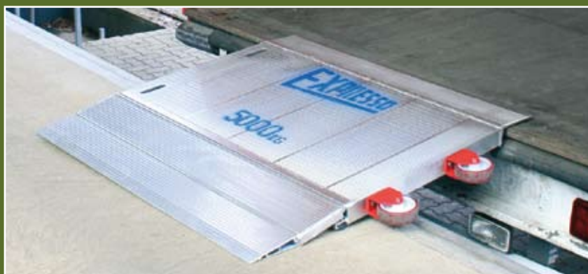
Type F 7005