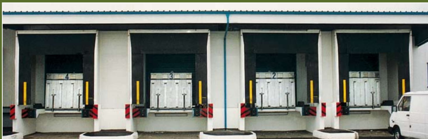
Type F 8862/1115

These classical spring-loaded dock levellers are mounted in fixed guide rails (see page 2), and are used wherever regular loading/unloading operations are carried out at specific locations. The dock levellers can support loads up to 5000 kg. Angled roll-on/roll-off plates ensure smooth traversing. The levellers are lowered by means of a chain with a handle. When not in use, the leveller is raised to the parking position, where it is secured in the upright position by a spring mechanism. The mechanism is released manually. The classic solution for dock-edge levelling.