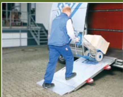
... load/unload. Done!