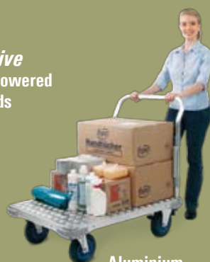
Aluminium- four-wheel carts