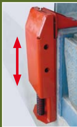
Type F 9019010 (per bumper), lacquered finish (mounted 150 mm above ramp height) Type F 9019011 (per bumper), lacquered finish (mounted 250 mm above ramp height)