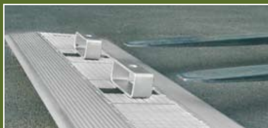
Accessory Type F 9019002, optional forklift prong pockets