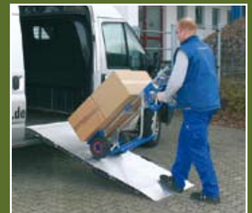
... load/unload. Done!