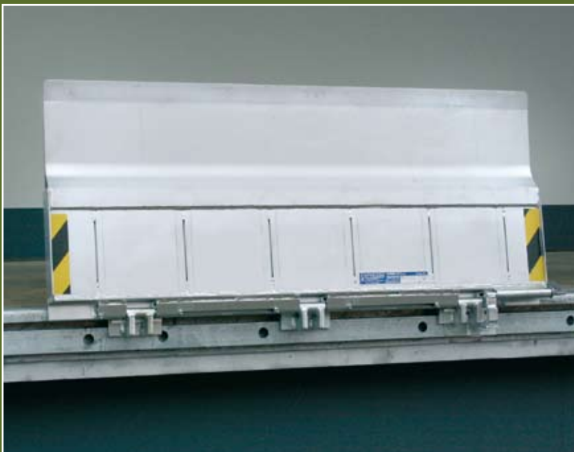
Type F 8860/6515

Wherever relatively small differences in height between truck and ramp must be compensated, these levellers are the perfect answer. Three sliding hinges mounted in ball bearings make these dock levellers unbeatable in terms of application flexibility. Provided the wear-resistant, long-life guide rail (see page 2) has been fitted along the full length of the ramp, the leveller can be moved easily and positioned precisely in the loading/unloading position. Truck manoeuvring is simpler, which ensures less time for operations at the ramp. All versions are fitted with an automatic latch that secures the leveller in the upright position, with controlled release by means of a foot-operated pedal. For safety reasons, it is not possible to move the levellers in the lowered (working) position. An operating lever is used to lower and position the leveller easily and ergonomically.