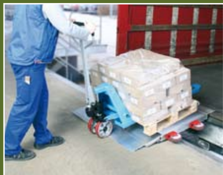
... load/unload. Done!