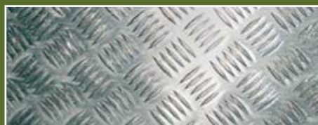
Five-bar studded profile

The surfaces of our aluminium dock plates & dock boards ensure non-slip traversing in unfavourable weather conditions. Whether five-bar, cross-grooved or cross-grooved 'Plus', all available treadplate surface options meet the highest quality standards, and offer increased safety and mobility.