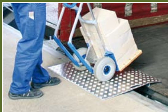
Type F 8762

These light, mobile dock plates can be transported conveniently in delivery vehicles, or be stored in the goods inwards area. With their non-slip, five-bar studded treadplates, these aluminium dock plates only require minimum storage space, because instead of protruding handles, they are fitted with handhold cutouts. The angled roll-on/roll-off plates ensure smooth traversing with loaded transport equipment.