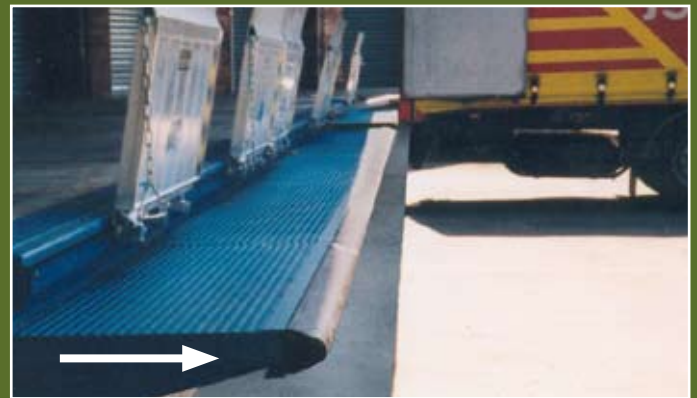
Type F 6026500 (650 mm), Type F 6027500 (750 mm), Type F 6029500 (950 mm) – per meter

This compact docking aid consists of three practical safety components: A front-mounted safety buffer with rubber profile to protect the van, an integrated guide rail Type F 6016516 (see page 2) for sliding dock levellers (see page 12), and a fixing bracket (on request) for perfect mounting to the ramp.