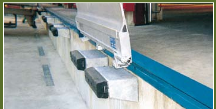
Type F 9010 (per bumper)

The compact construction of this docking aid is an all-in-one solution. The buffer includes a guide rail Type F 6038860 (see page 2) for mounting the spring-loaded dock levellers Type F 8860/... whereby the bumper has ribs that help prevent damage to the trucks.