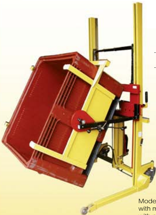
Model shown is a LEV 600 with manual drive, lift and rotation, with plastic box.