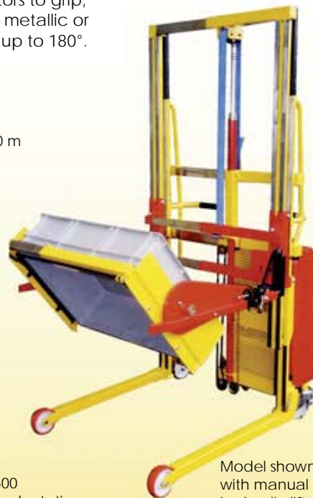
Model shown is a LEV 300 with manual drive, electro- hydraulic lift and manual rotation, with plastic box.