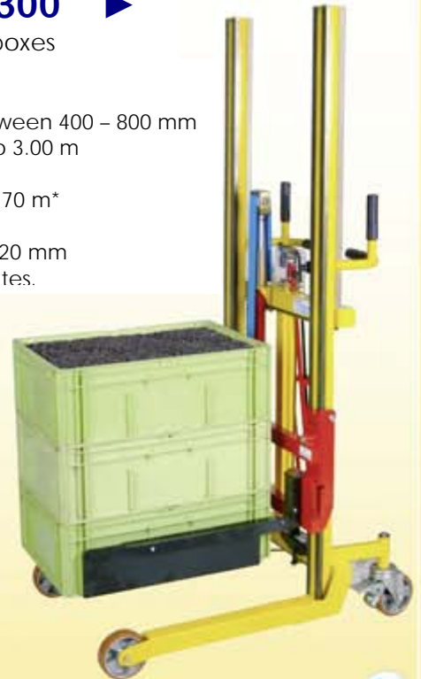
Model shown: LEV 300 with manual lift and drive